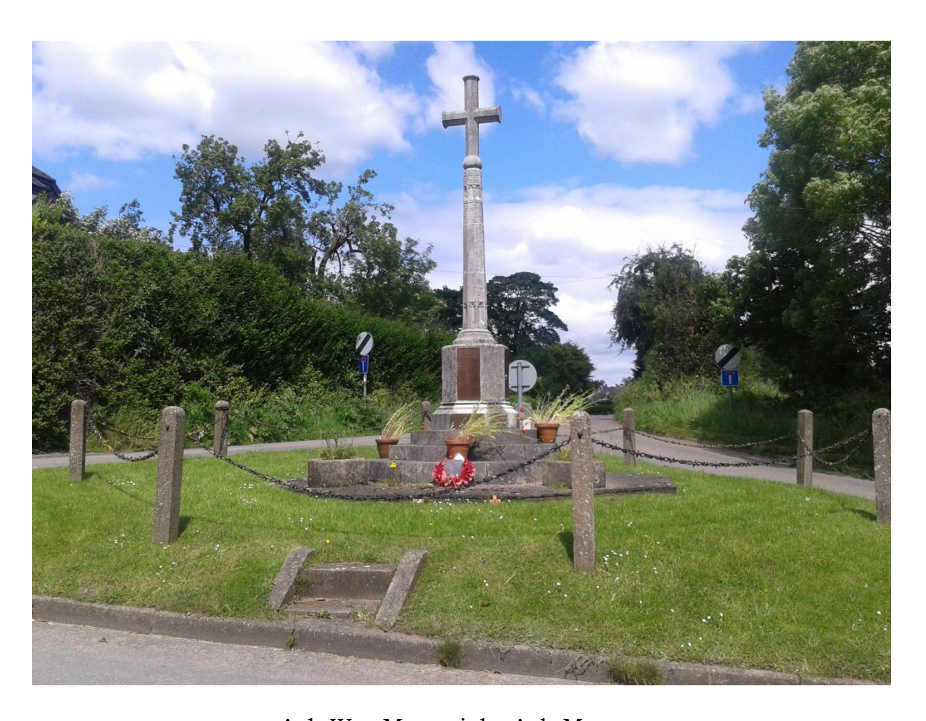
Ash War Memorial – Ash Magna