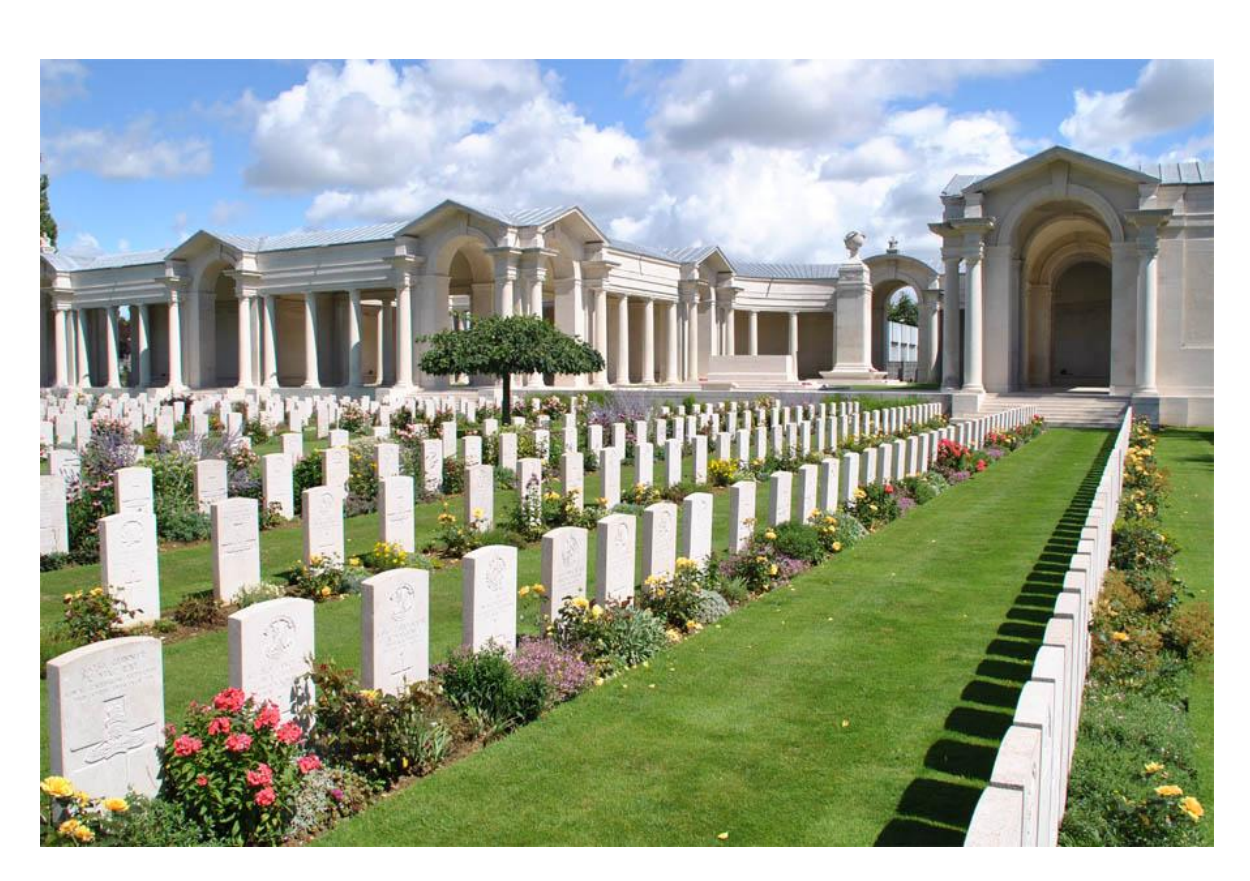
Faubourg D'Amiens Cemetery, Arras