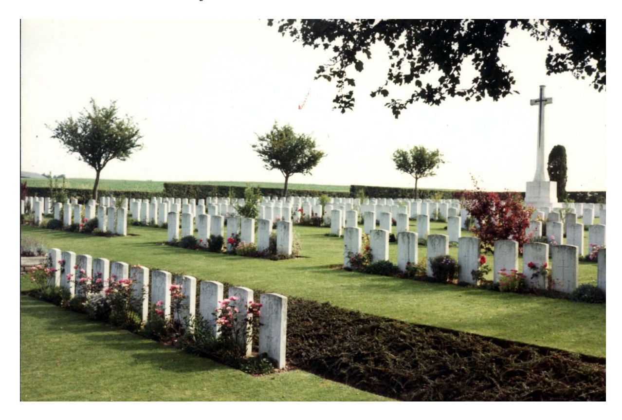
Sainte Emilie Valley Cemetery, Picardie.