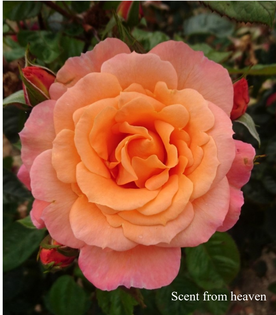
Scent from heaven