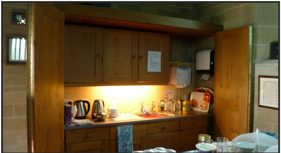
"Kitchen in a Cupboard" at St. John the Evangelist Church at Lyneal with Colemere