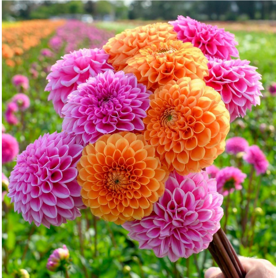
Silver Sorbet Dahlias